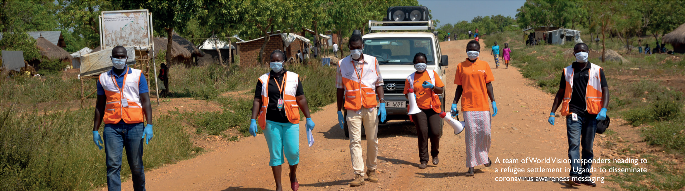
A team of World Vision responders heading to a refugee settlement in Uganda to disseminate coronavirus awareness messaging