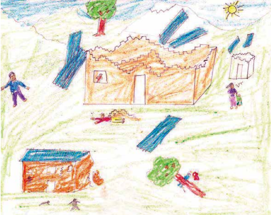
A child's drawing showing destruction in his village caused by the earthquake

While shelter, education, health and hygiene emerged as priority concerns for children, broader impacts of the earthquakes were also discussed in the H-assessment, expressive drawing and body mapping exercises. Most prominent among the impacts described by children in these exercises were: