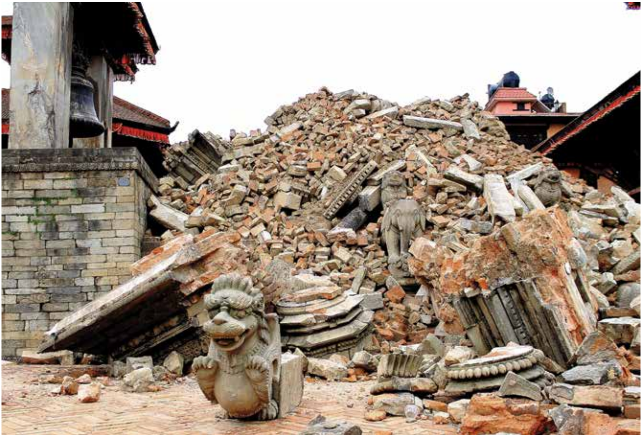
The earthquake destroyed numerous heritage sites, including Vatsala temple, Fasidega and other cultural sites in Bhaktapur.

Children in 67 FGDs referred specifically to feelings of sadness and insecurity as a result of the destruction of cultural heritage sites including temples and other places of worship, as well as monuments and historic buildings. Temples, stupas and monasteries have both a spiritual and social significance and would have been visited by many children on a daily basis on their way to school, at festivals and on other occasions. Moreover, during a crisis such as that being experienced in Nepal, children and their families would normally have gone to temples or other places of worship to pray for better times.