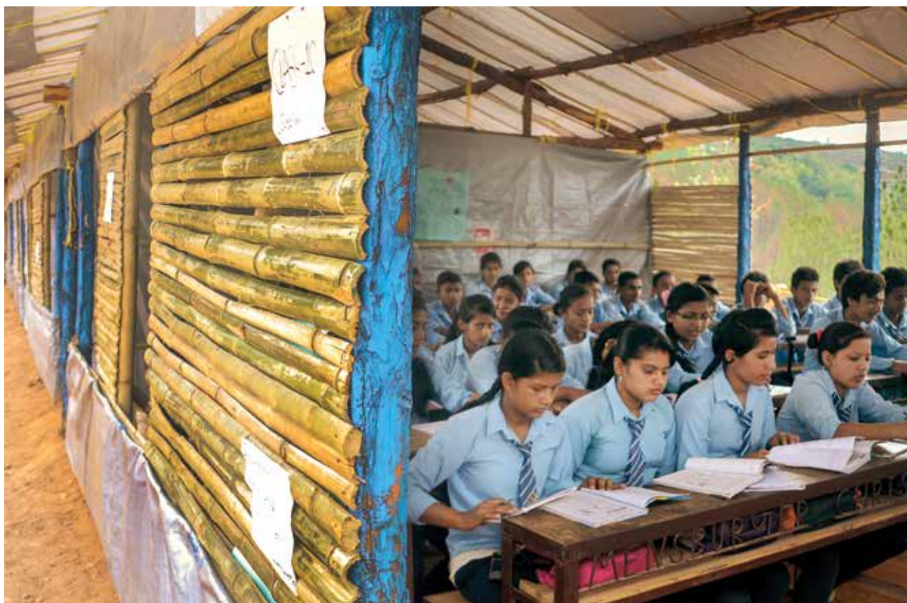
Classes are running in temporary learning space at a school in Sindhupalchowk.