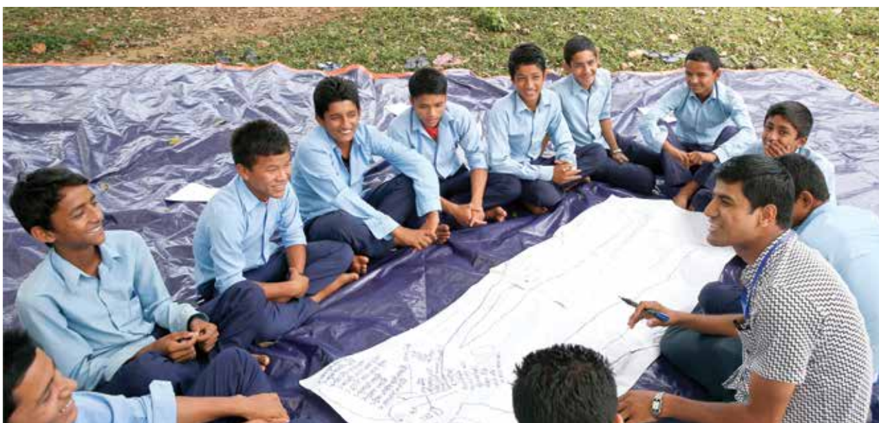
A facilitator leads a group of boys participating in the consultation with children in Dhading.

The visioning tool (using drawings, writing and discussions) was used to seek children's ideas about what they wanted their lives and communities to look like after one year. In the expressive drawing exercise, children were also asked to suggest solutions to the concerns they had identified. This section reflects the outcomes of these two exercises.