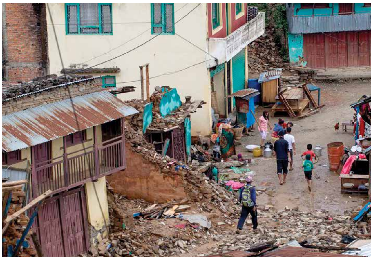
Houses destroyed during the April 25 earthquake at Rupinala village, Masel VDC in Gorkha