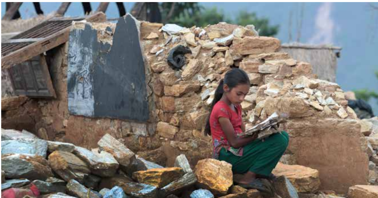
A young girl reads a book that she found among the rubble of destroyed school in Gorkha

Among the children who expressed dissatisfaction, over half said they thought relief items had been distributed unfairly and that those with political connections were able to access relief more quickly and easily. Others said that they or others from more marginalized or remote communities had difficulty in accessing relief and in some cases had received no assistance.