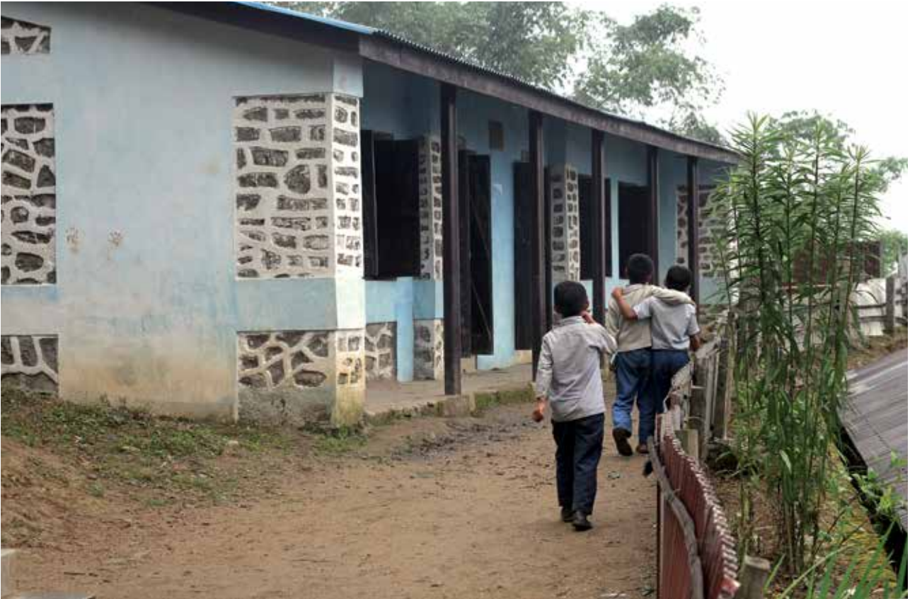
A retrofitted school building in Ilam, rebuilt after the 18 September 2011 Earthquake.