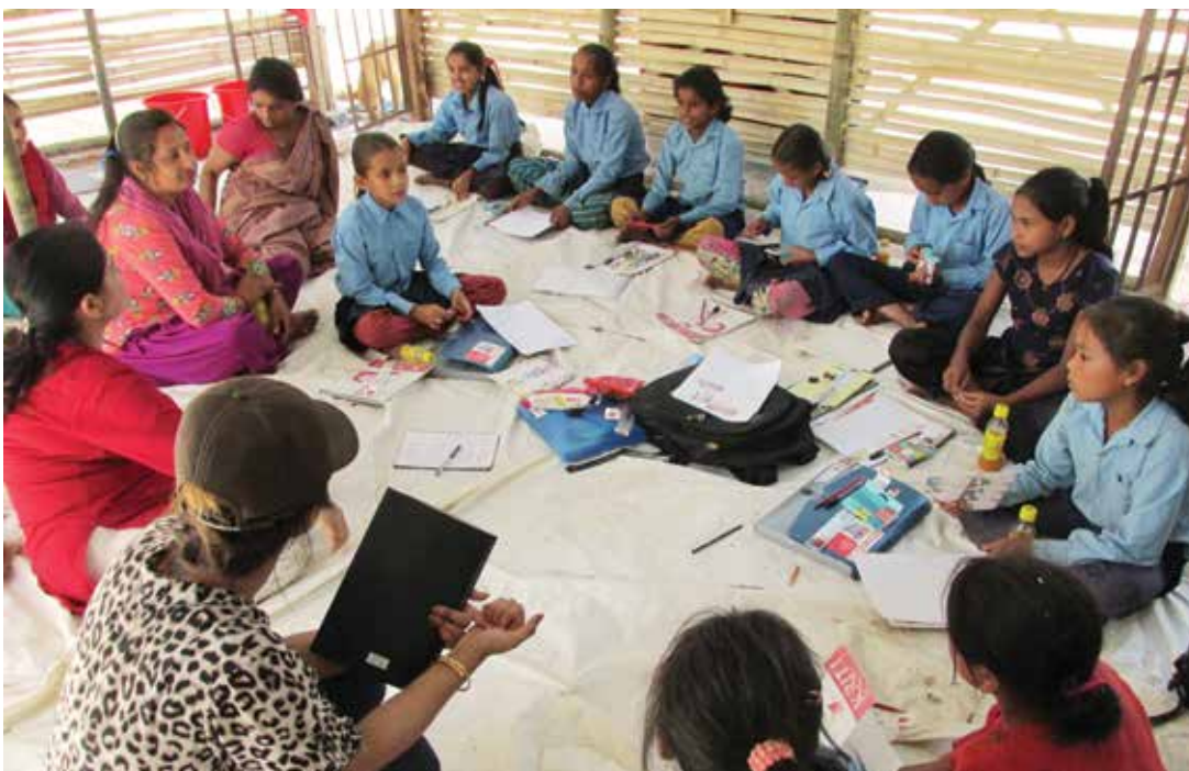
A group of girls share their vision for the future during a consultation with children.

More details of the methodology and a summary of strengths and limitations of the consultation can be found in Annex I.