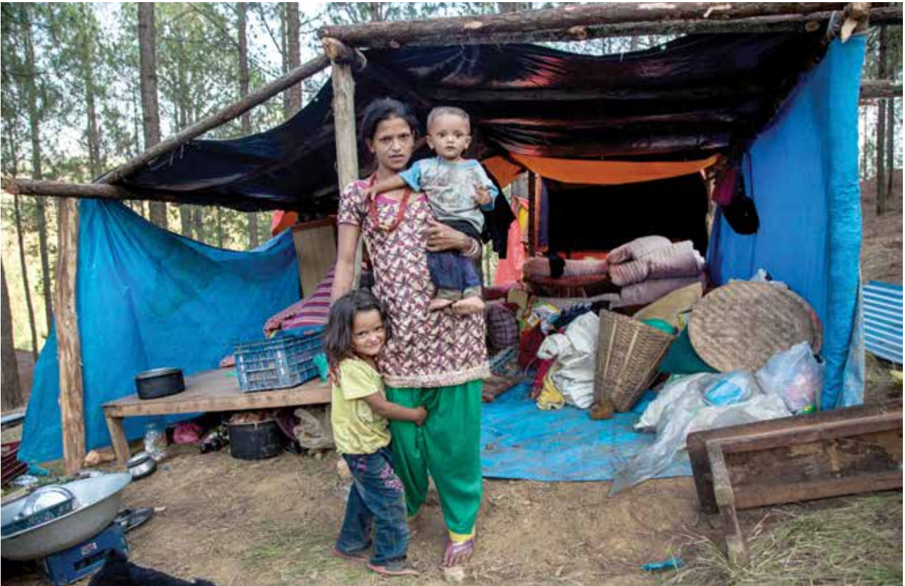
Many children continue to live in temporary shelters after the earthquake destroyed their homes.