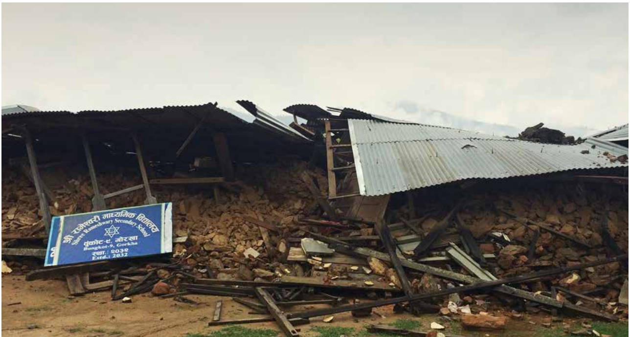
A school in Gorkha completely destroyed by the April 25th earthquake.