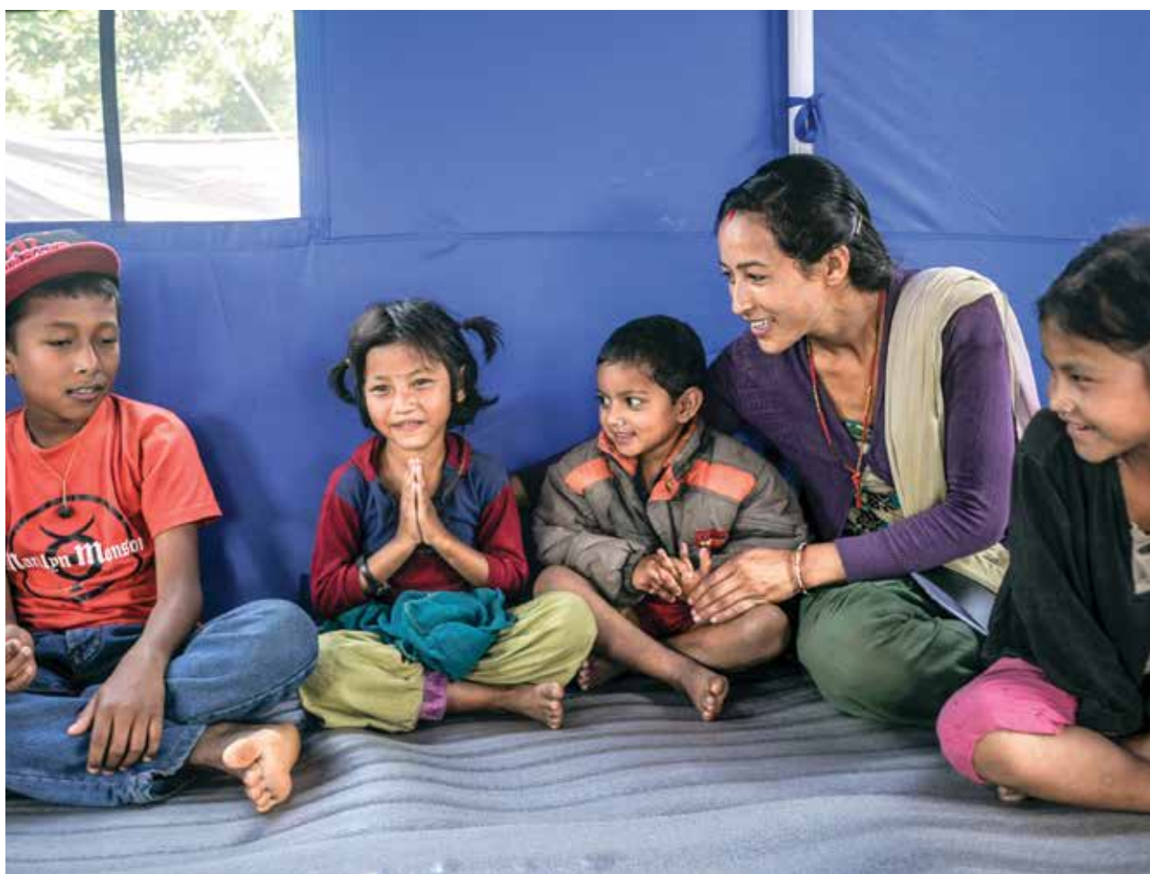
Children attend one of the first Child Friendly Safe Spaces to open in Gorkha