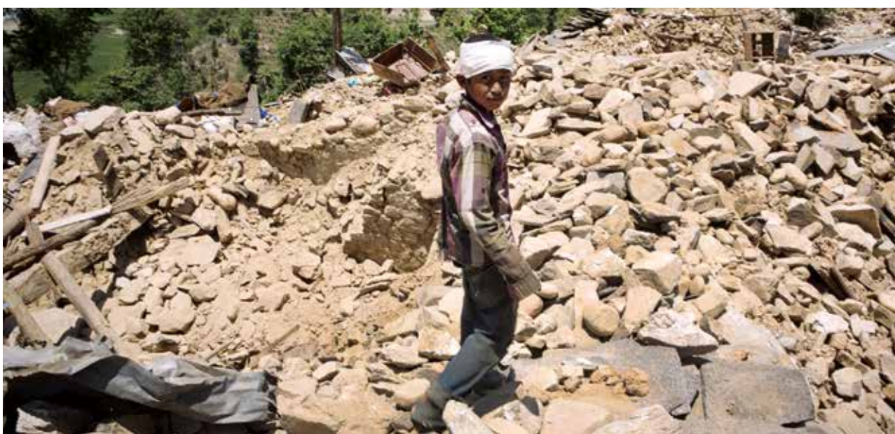
A boy shows his home destroyed by the earthquake.