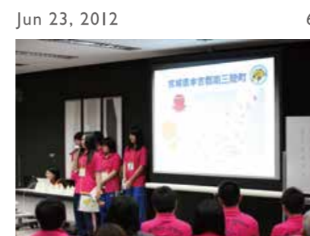
Jun 23, 2012 MTDP event in Tokyo: "The POWER We Share, The POWER We Have - What the JLs Can Do Now after the Disaster"

MVC Buranko and other children's groups from Tokyo Metropolitan area shared their activities in their own communities, and exchanged their opinions for better future.