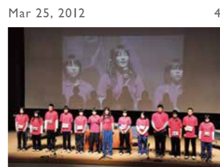
Mar 25, 2012 MTDP event in Minamisanriku: "Smiles for Children! Dreams for the Town!" - Children's Discussion on the Town's Reconstruction"

MVC Buranko shared their ideas to the town mayor on the town's rehabilitation plan.