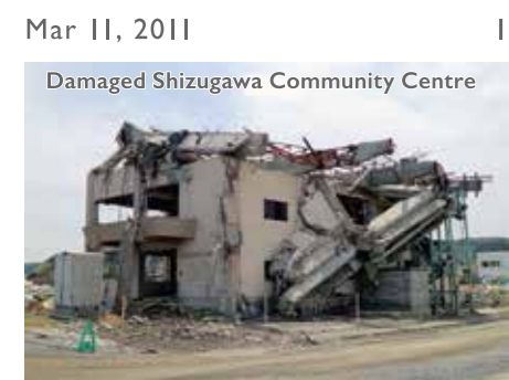
Mar 11, 2011 Damaged Shizugawa Community Centre