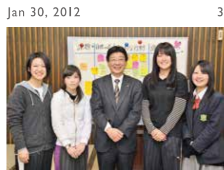
Jan 30, 2012 Discussion with the town Mayor of Minamisanriku

MVC Buranko shared their ideas to the town mayor on the town's rehabilitation plan.