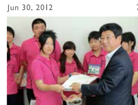
Jun 30, 2012 Proposal was submitted! MVC Buranko put together their ideas on the town's rehabilitation plan into a proposal, then submitted to the town mayor of Minamisanriku.

MVC Buranko and other children's groups from Tokyo Metropolitan area shared their activities in their own communities, and exchanged their opinions for better future.