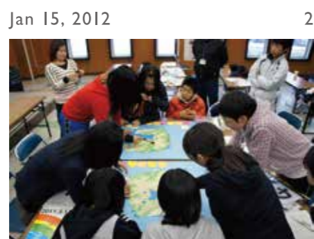
Jan 15, 2012 MTDP workshops started!