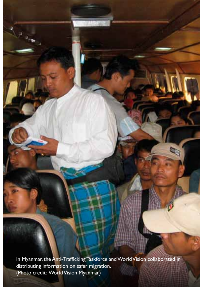
In Myanmar, the Anti-Trafficking Taskforce and World Vision collaborated in distributing information on safer migration.

In 2007 after a rigorous assessment and consultative process, World Vision initiated its second regional project entitled 'Regional Advocacy anti-Child Trafficking Programme (RACTP)' in GMS countries. Currently, RACTP is being implemented in all of the countries in the GMS. World Vision's main goal is to assist in the establishment of a positive and enabling policy environment to effectively combat trafficking in persons, especially children, to reduce and ultimately eliminate the problem in the GMS. The main strategy involves developing regional infrastructures and mechanisms for sharing information and learning, and developing appropriate strategies for advocacy to influence the GMS governments.