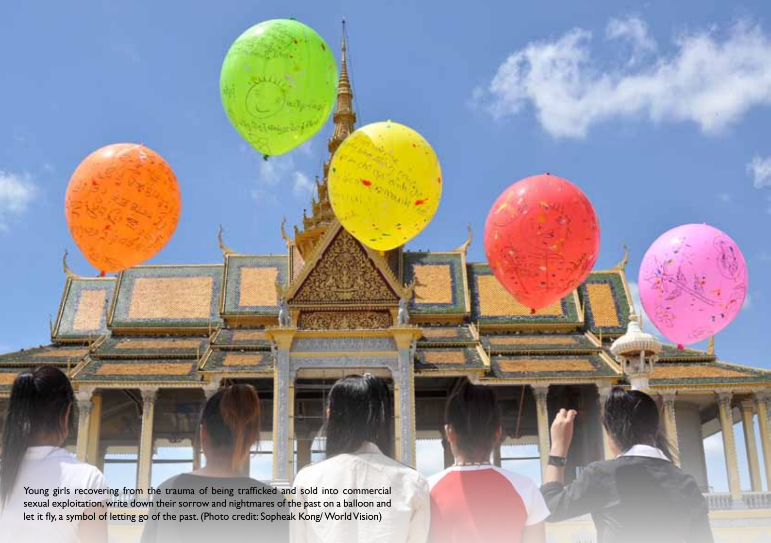
Young girls recovering from the trauma of being trafficked and sold into commercial sexual exploitation, write down their sorrow and nightmares of the past on a balloon and let it fly, a symbol of letting go of the past.