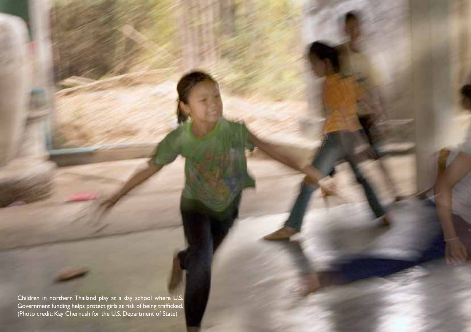
Children in northern Thailand play at a day school where U.S. Government funding helps protect girls at risk of being trafficked.