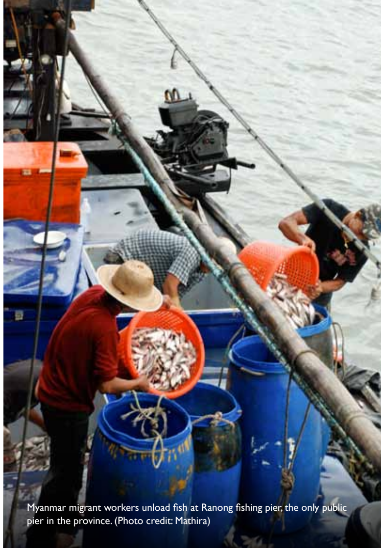
Myanmar migrant workers unload fish at Ranong fishing pier, the only public pier in the province.