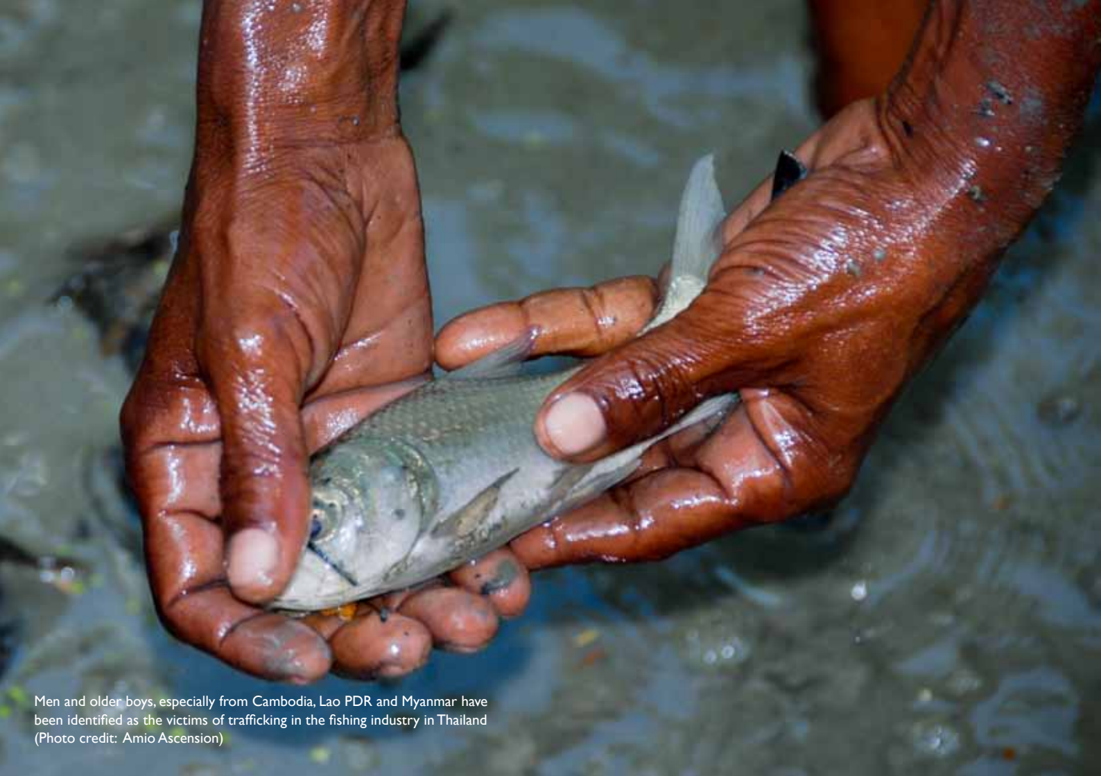
Men and older boys, especially from Cambodia, Lao PDR and Myanmar have been identified as the victims of trafficking in the fishing industry in Thailand