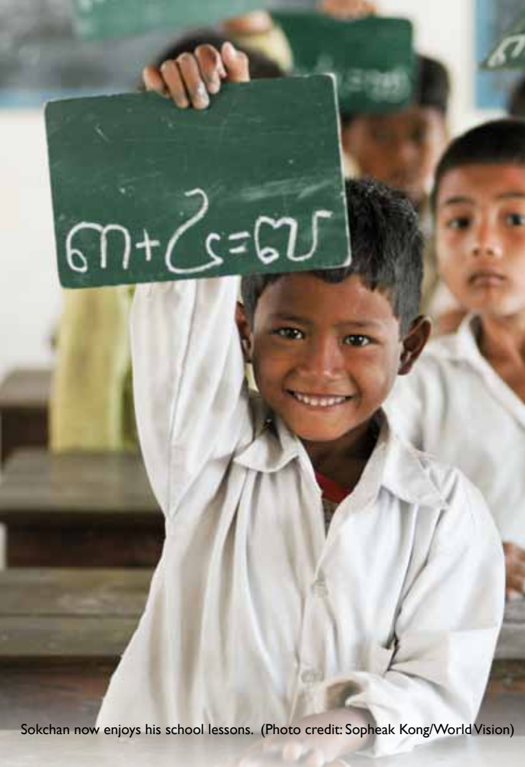
Sokchan now enjoys his school lessons.