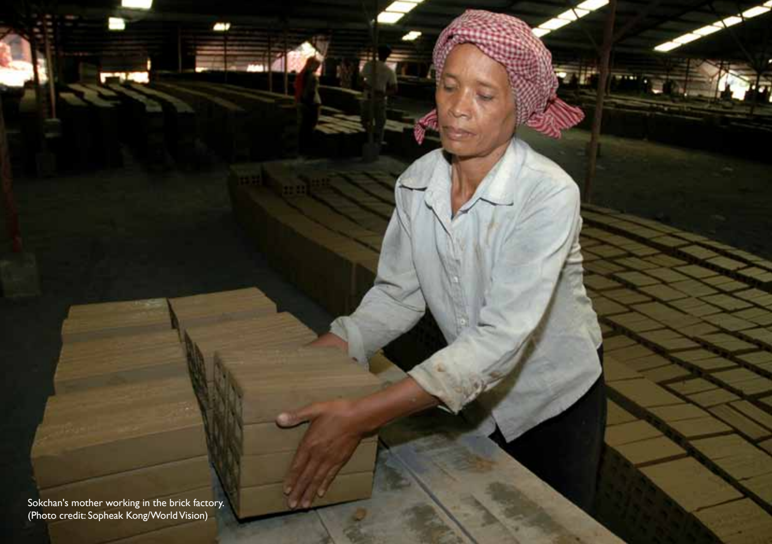
Sokchan's mother working in the brick factory.