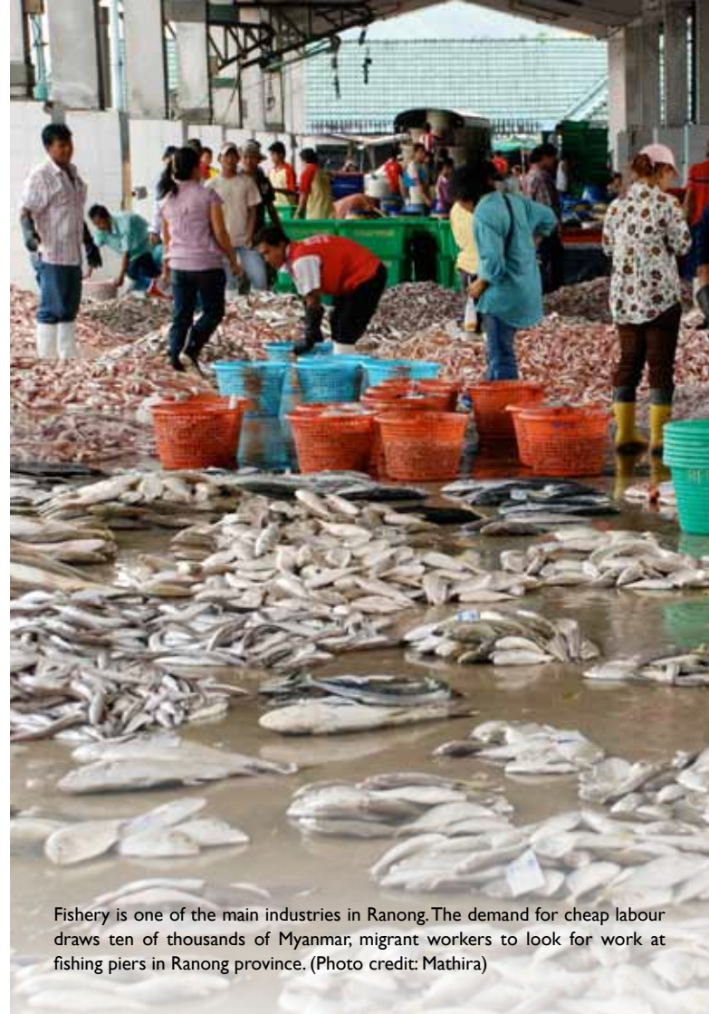
Fishery is one of the main industries in Ranong. The demand for cheap labour draws ten of thousands of Myanmar, migrant workers to look for work at fishing piers in Ranong province.

Rescued workers shared stories of an ordeal that demonstrates extreme violation of human rights and Thai labour laws. The men, women and children were forced to work for 18 hours or more every day and were paid as little as 400 baht per month ($13), out of which they had to buy food from the factory's owner. If workers rebelled against their situation, they were often publicly humiliated or tortured and sometimes even raped.